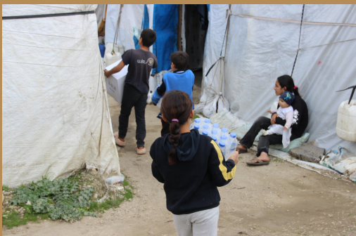
Food & Water distribution at a refugee camp in Turkey