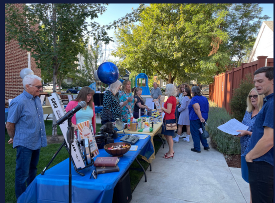
Ministry Fair - Fall 2023

God has given us a variety of gifts and passions, and it's wonderful to watch many use them in new ways!