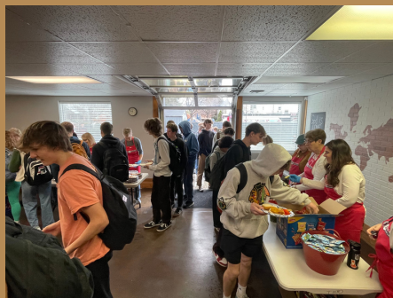
Boise High Church Lunch