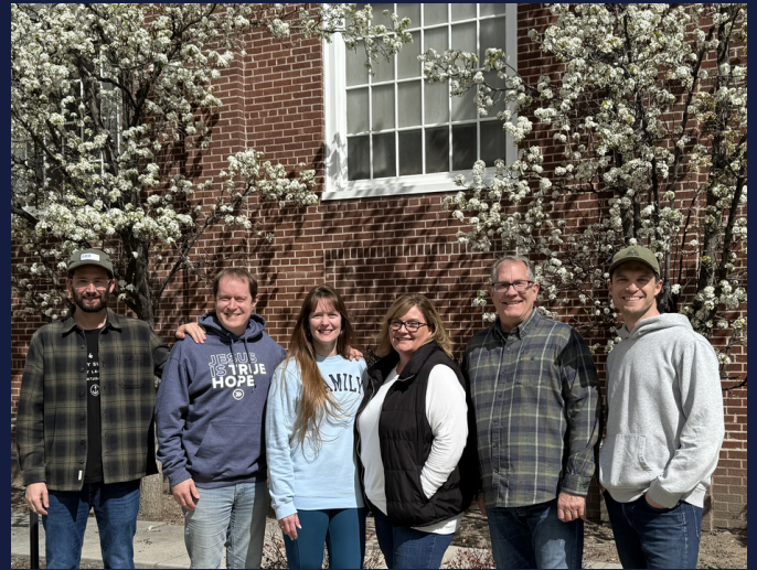
Downtown Ministry Staff Team